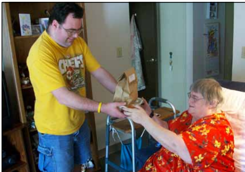
As part of his day with UCP's Adult Services, a man who receives services at UCP delivers Mobile Meals to an InterServ client.