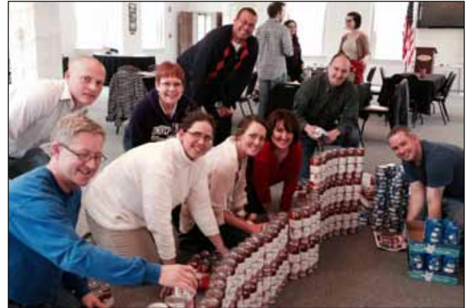
The 32 nd class of United Way Leadership St. Joseph graduated in early December. Some of the members are pictured here, as they participated in a project for a local non-profit agency.