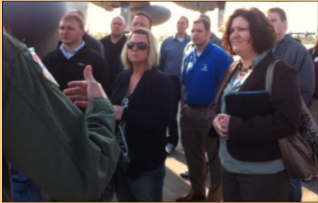
Thank you to all sponsors, employers and graduates who have helped successfully bring United Way Leadership St. Joseph to its 30 th year!