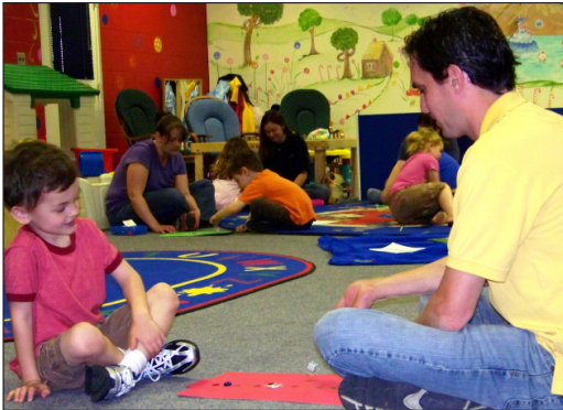
United Way KinderClub parents have been enthusiastic about receiving guidance from their schools before their children begin kindergarten.

United Way Success By 6 has provided the detailed curriculum, children's books, and all supplies used for United Way KinderClub meetings. ♦