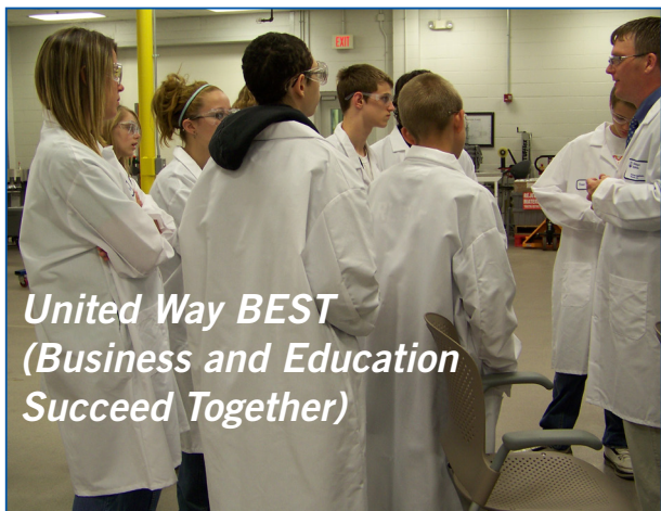
United Way BEST (Business and Education Succeed Together)