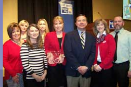
spirit of community