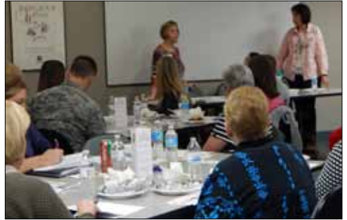
Taste of United Way featured a different agency or United Way Initiative/Program each month this year. Here: guests learn about Northwest Missouri Community Services.

new and important about how our community works together at every Taste of United Way I've gone to."