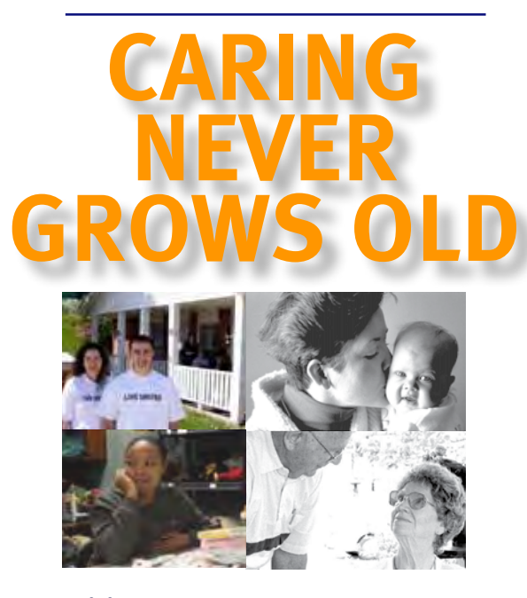
100 YEARS AND STILL SERVING IMPROVE LIVES TODAY AND INTO THE FUTURE

In 1924, N. S. Hillyard accepted the monumental position as the first volunteer to head the campaign, aiming to raise $140,000 and actually bringing in $135,468.