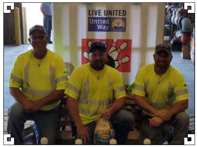
A United Way workplace rally-Turkey Bowling at KCP&L